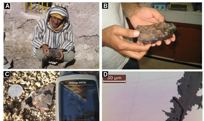
Figure 2. Meteorite fragments of Imilchil. A: Sample of more than 9 kg. B: Sample of more than 1.5 kg. C: Sample of 290 grams on site. D: Band of kamacite in a plessite matrix.

The samples found have a rusty appearance, with scales of alteration of several centimeters thick of oxides and iron hydroxide covering the entire outer surfaces thereof, indicating a long residence time in the soil. The polished surfaces don't show the Widmanstätten figures. The meteorite of Imilchil is an Ataxite rich in nickel, it consists mainly of iron mixed with 17, 3% nickel (X-ray fluorescence method in the department of Earth sciences, the University of Ferrara). The scanning electron microscopy revealed the presence of thin diffuse bands of kamacite (around 25 µm wide) in a matrix of plessite (Figure 2D) this texture is the evidence of structural deformation due to shock impact.