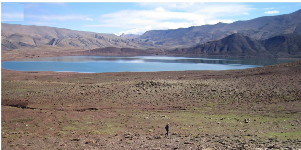
Figure 1. Panorama of the Isli Lake.

More than 183 structures of meteoritical impacts are highlighted on the Earth [1], including only three dual impact craters reported [2]. The impact craters of Isli and Tislit, 32°13'N, 05°33'W; 32°12'N, 05°38'W are respectively, located at 10 km and 4 km from the Imilchil village on the Central High Atlas in Morocco at respective altitudes of 2272 and 2266 meters. They are spaced apart from each other by 9.4 km. The origin and the date of formation of these two lakes are still unknown today. Surveys undertaken near them and in the surrounding areas leads to believe that they correspond to a dual meteoritical impact crater. We present here the discovery of this new dual impact crater in the Central High Atlas in Morocco, It is interesting, first by its young age, its perfect conservation and the geomorphology of the two depressions (Figures 1).