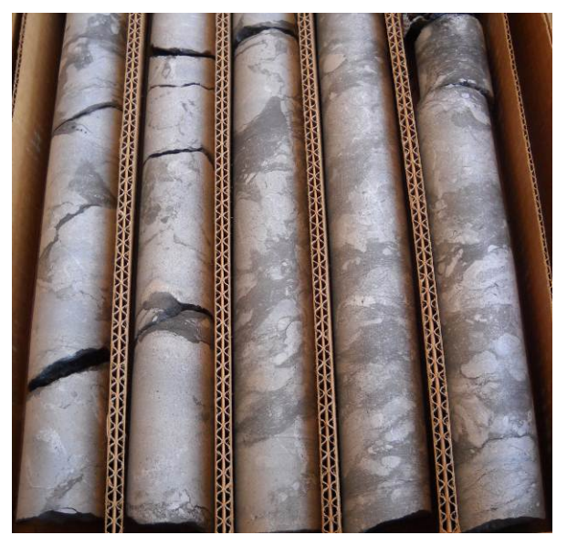
Figure 2. Example of drill cores in standard boxes from the USGS Flynn Creek Crater Drill Core Collection in Flagstaff, AZ.

Numerical Modeling. Results from the initial textural and compositional characterization of the drill cores will be used to inform and constraint a series of numerical models meant to better understand the formation of Flynn Creek crater as well as the crater's potential for impact-induced hydrothermal activity. Hydrocode models will be used to perform a suite of impact simulations designed to recreate the formation of a 3.8 km diameter crater using different impact velocities. Simulation results will be compared to the