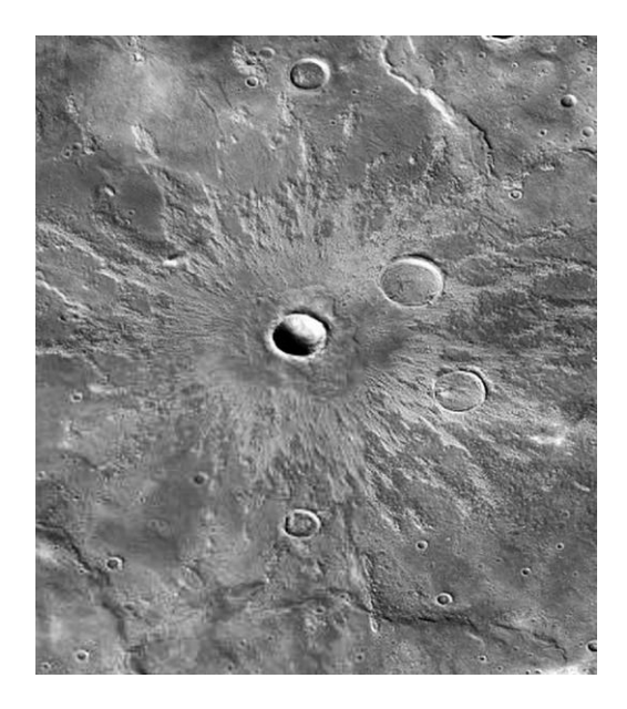
Figure 1. Vaduz is a 1.85 km diameter LARLE crater located at 38.2°N, 15.8° E.

Introduction: We proposed a model for the formation of the extensive outer layers of low aspect-ratio layered ejecta (LARLE) craters (Figure 1) by gas transport. While thin, this layer may extend outward for 20 crater radii from the rim of fresh LARLE craters. Based on the morphologic and morphometric characteristics of these craters [1, 2] we propose that the LARLE layer is emplaced by base-surge formed by similar mechanisms as those generated by explosive crater experiments and some volcanic eruptions